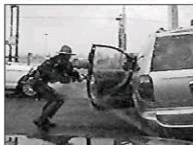
A highway patrol trooper crouches behind the minivan Henry abandoned.